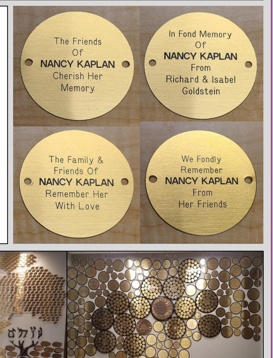
Our Tree of Life continues to grow. For all happy occasions such as birthdays, anniversaries, birth of a child, etc., remember the Congregation Beth Israel Tree of Life. This will be a permanent recognition of the special occasion. Leaves start at $300. Rocks are also available.